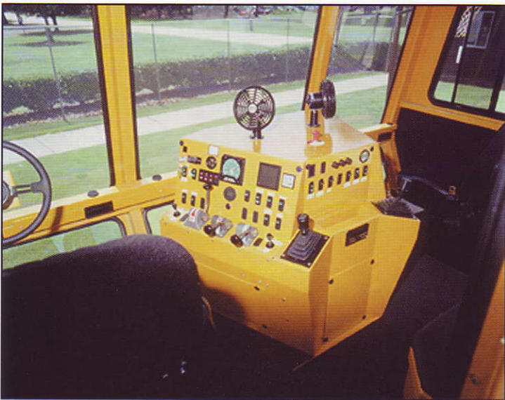
Dual operating positions.