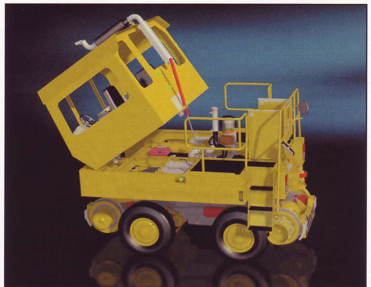
Hydraulically operated tilt cab.