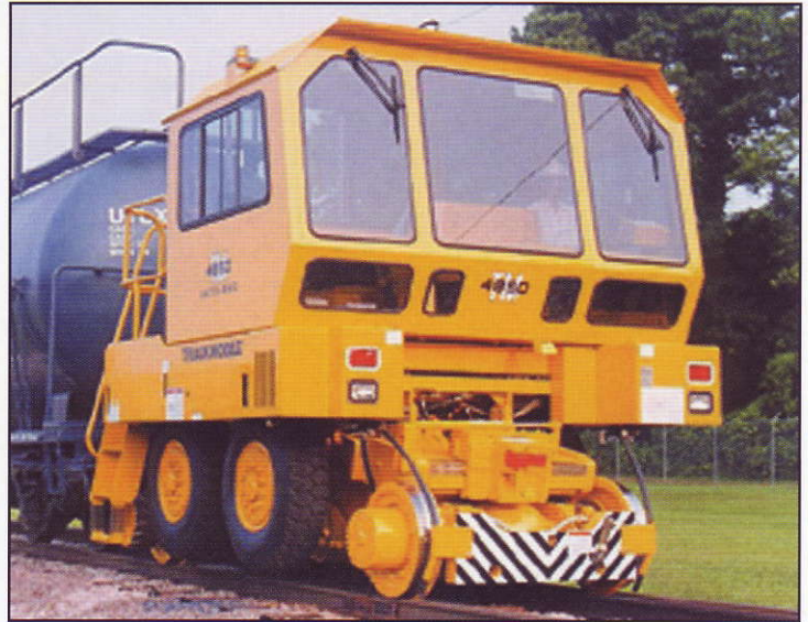
Less than 80dBA sound level in cab.